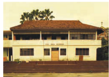
Pei Hwa School in 1988.