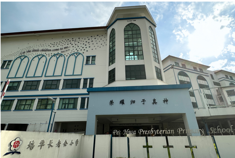
The Reserve Residences will have a link bridge connecting to the future community building, located next to Pei Hwa Presbyterian Primary School.

Based on schoolbell.sg, Pei Hwa Presbyterian Primary School is ranked number 1 with popularity of 255% in 2022 .